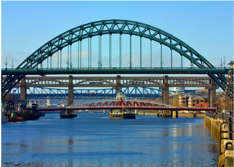
The Tyne Bridges

Can you name all the bridges that span the River Tyne?