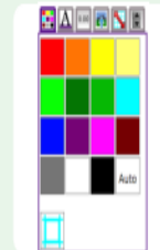
The 2Calculate toolbox