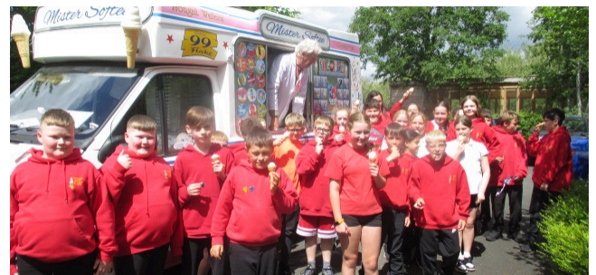
Newburn Manor Primary