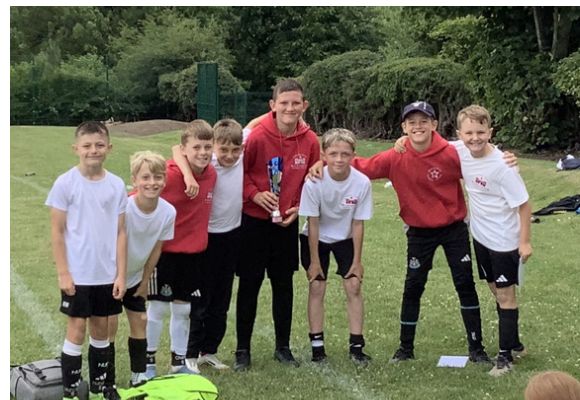
Milecastle Primary - Boys Football