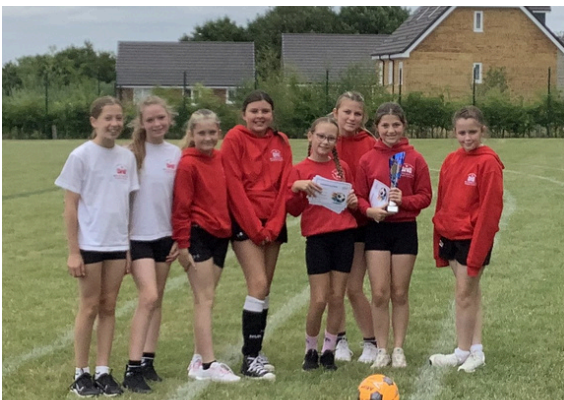
Milecastle Primary - Girls Football