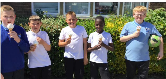
West Denton Primary